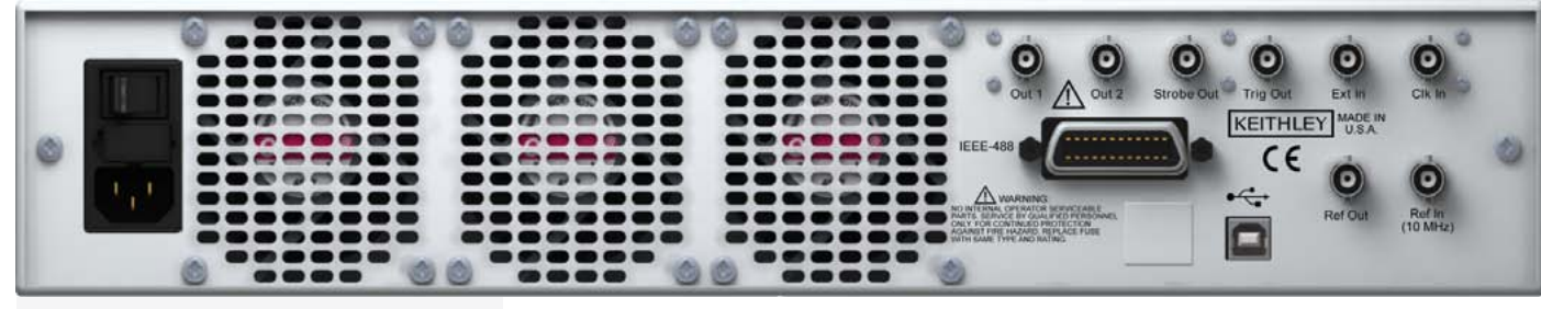
Figure 2. Model 3402-R, Dual-Channel with Rear Outputs